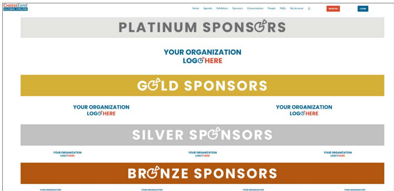
Event platform sponsor webpage.